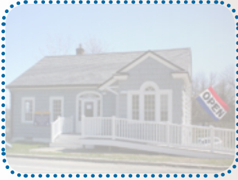
Lake Champlain Visitors Center