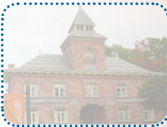
Lake George Historical Association & Museum