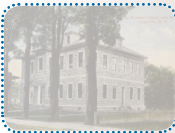
Pember Museum of Natural History