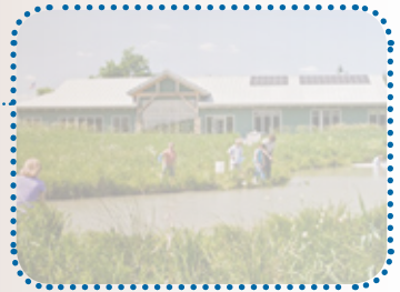
Missisquoi National Wildlife Refuge