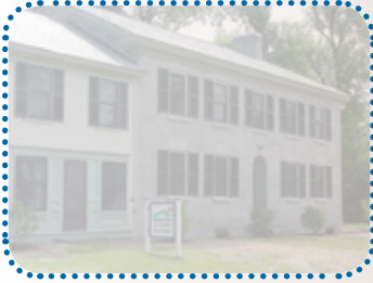
Gordon Center House