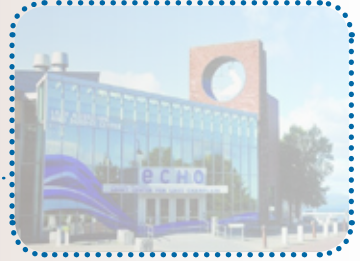
ECHO, Leahy Center for Lake Champlain