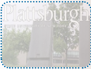
Plattsburgh State Art Museum