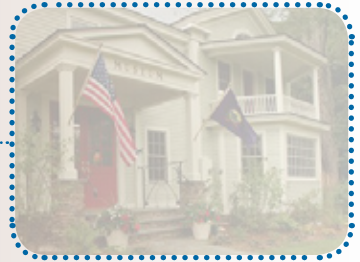
American Museum of Fly Fishing