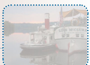
Lake Champlain Maritime Museum