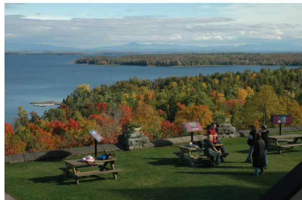
The waysides are located in a very scenic picnic area.

A 2008 Lake Champlain Quadracentennial Implementation grant from the CVNHP/LCBP allowed the Clinton Community College to develop and install three outdoor interpretive wayside signs. The exhibits are located on the Bluff Point scenic overlook with views of historic Lake Champlain and Crab and Valcour Islands. The wayside interpretation increased the public's awareness about the natural environs and significant historic events in this area of the Champlain Valley. The bilingual (English/French) signs, installed in July 2009, are accessible throughout the year to students, the local community and visitors to the region.