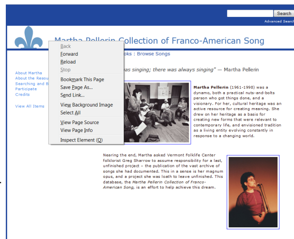
The searchable database is online

A 2008 Lake Champlain Quadricentennial Legacy Grant from the LCBP/CVNHP allowed the Vermont Folklife Center to catalog all of these songs, scan the contents of the nine songbooks, translate all song texts into English, pair song texts with existing recordings, build a database with multiple searchable fields, and create an online portal for public access to the collection.