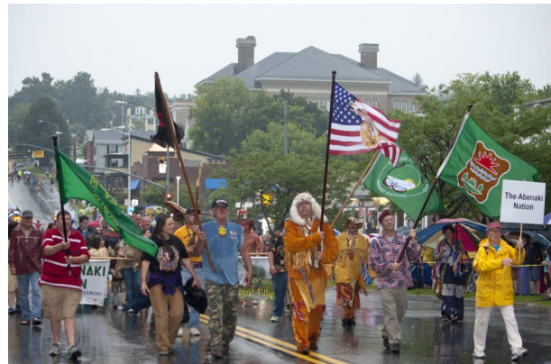
The Abenaki led the parade in the pouring rain

and culture. The free programs ran from Saturday, July 4 through Sunday, July 12, 2009. In all, more than 200 performers and artists appeared on free stages—playing to more than 18,000 people, and an estimated 150,000 people attended the festival overall.