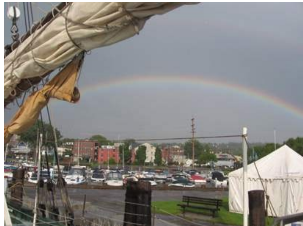
Skies cleared briefly during Burlington's celebrations

Working with its partners at the Main Street Landing Performing Arts Center, LCMM also implemented a highly successful, culturally enriching series of lectures, performances and exhibits. Nearly 700 people attended LCMM's seven free lectures/performances from July 5-10 held at Main Street Landing's Film House.