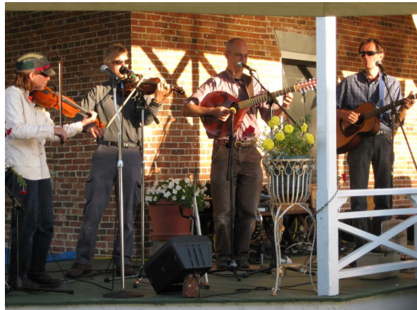
Folk music was provided by Atlantic Crossing