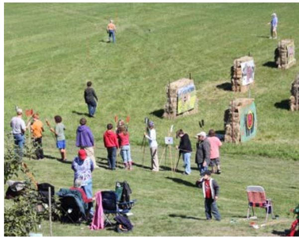
Part of the programming included lessons on how to throw an atlatl spear at prehistoric targets

Through rich and diverse programming of art, athletics, song, and storytelling, the Festival of Nations made the region's cultural and natural history accessible to participants. Exhibits and special events covered the three early cultures in the Chimney Point area – Native American, French colonial and early American. Entrance fees were waived for the park and over 1,400 people joined in the activities at Chimney Point during the Festival's duration – a nearly 14-fold increase from previous years.