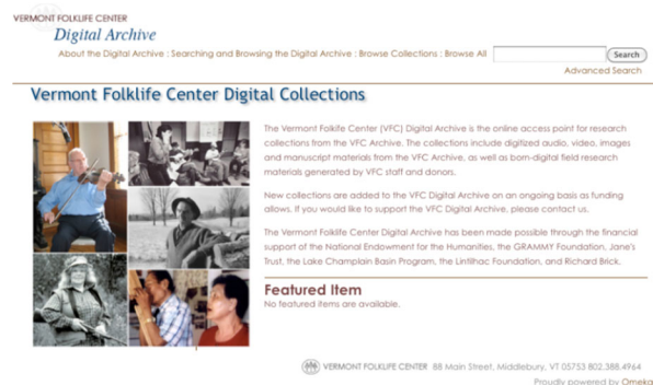
A screen shot of the Vermont Folklife Center's Digital Collection web page.

Chansons and Fiddle Tunes continued where the previous project left off, with two primary goals in mind: 1. The modification of the extant online Omeka database from a specific resource dedicated to the Martha Pellerin Collection of Franco-American Song to a general online access platform for the VFC Archive; and 2. Digitization, transcription, cataloging and data entry aimed at making available related to an additional collection of Franco-American music materials: the Derosier Family Collection.