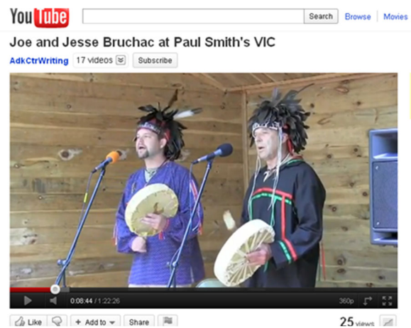
Abenaki storytellers can be found at You Tube.

http://www.adirondackcenterforwriting.org/index.php?p=98