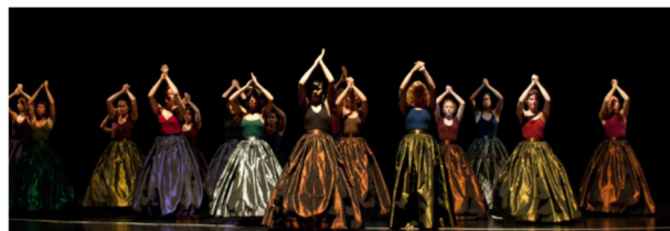
From The New World Performance