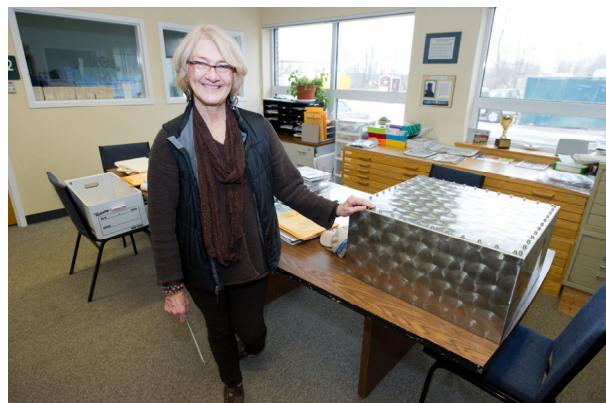
The stainless steel time capsule is vacuum sealed

The capsule contains historical materials as well as items representative of 2009. It will be opened in 2106 to provide an early event for the 500th anniversary commemoration of Champlain's exploration of the lake.