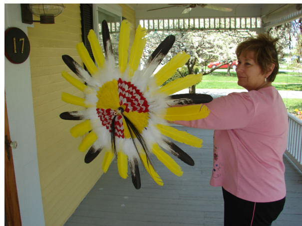
An Abenaki artisan displays a ceremonial sun disc.

The Vermont Indigenous Ethnobotany Project reviewed the information in the public recognition applications of the Missisquoi (Swanton, VT), Nulhegan (Northeast Kingdom), Koasek (Newbury, VT) and Elnu (Windham Co. VT) bands to extract the pertinent ethnobotanical “leads” and unite with local practitioners to observe and record the horticultural and other technological indigenous practices that use plants and plant products. The field data and materials were analyzed and interpreted for use by scholars and the public through publications, lectures and museum installations.