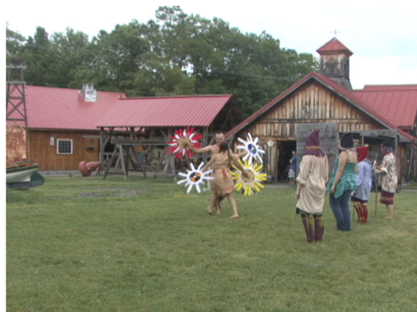
Abenaki Sun and Moon dance performed at the Lake Champlain Maritime Museum, summer 2011.

NEIWPC Code LS-2011-086 Date Complete: Feb. 8, 2012 Grant Amount: $9,959.00 Non-federal Match: $7,772.72 Total Amount: $17,731.72