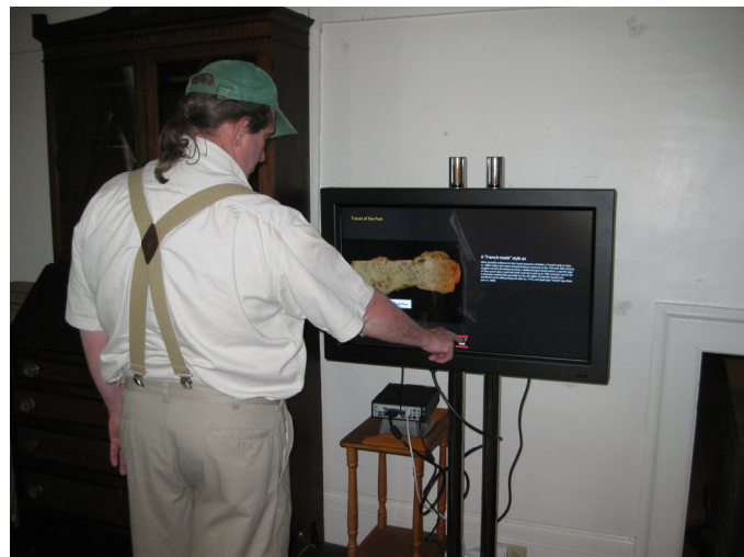
Visitors learn of ancient peoples with new technology

Funded by a Quadricentennial Legacy Grant from the CVNHP/LCBP the “Exploring 9,000 years of Human History at Chimney Point,” project was a collaboration between the University of Vermont Consulting Archaeology Program (UVM CAP) and the Vermont Division for Historic Preservation (VDHP). As a result of the project, an interactive touch screen system was installed at the Chimney Point Historic Site, Vermont. The system is operated and maintained by the VDHP and provides public access to exciting historical and archaeological research and interpretation of Chimney Point’s human history and archaeological resources. The technologically sophisticated system represents a major upgrade to existing exhibits helping to educate visitors and emphasize the significance of the archaeological and historical cultural resources at Chimney Point, Vermont.