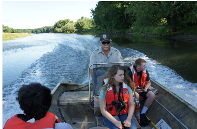
The Summer Science Experience was the first time several of the students from the community had been on the Missisquoi River.