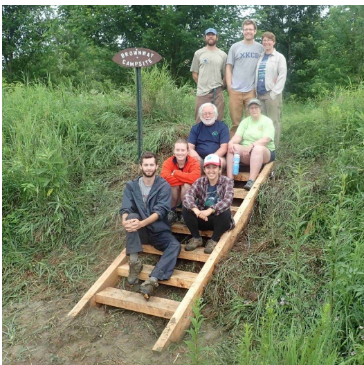
Volunteers on a newly installed log ladder at the Brownway Campsite access.

Working in concert with the Vermont Department of Conservation Wetlands, Floodplains, and Stream-bank Alteration and within the local permitting process, the NFCT established the Brownway Campsite including picnic table, sign-in box, composting privy, signage, trail corridor and tread improvements, and two access points in July 2016. Later that year, the NFCT worked with the Enosburgh Conser-