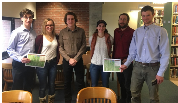
Seventeen students provided 322 volunteer hours in developing the Lamoille River Paddlers Trail map

The VRC is a land trust, focused on conserving and protecting special lands along the waters of Vermont. The VRC coordinates the Lamoille River Paddlers’ Trail, a community effort to improve opportunities for exploration of the Lamoille River.