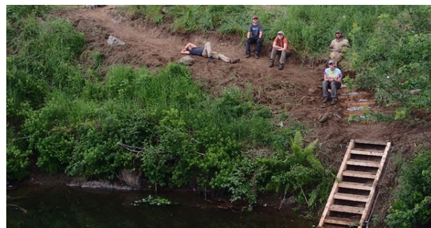
Above: The MRBA collected 344 samples from the Missisquoi River, Trout River, and tributaries in 2018.

Tasks addressed in 2017 Opportunities for Action :