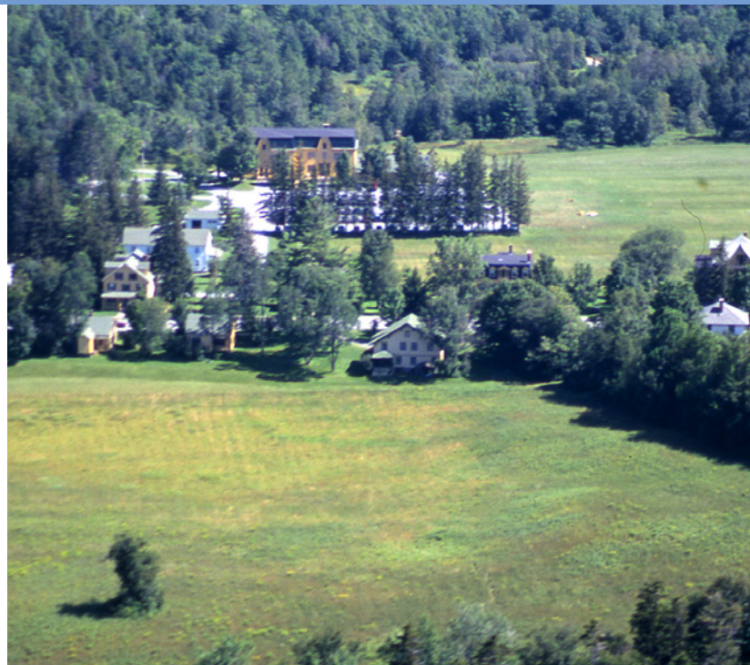
Bread Loaf in Spring/Addison County Chamber of Commerce

Motorists and bicyclists share scenic roads. Use caution on narrow, winding or unpaved roadway. Follow traffic laws and ride safely. Bicycles are vehicles by law and have the right to use public roads. You are responsible for operating your bicycle under all conditions.