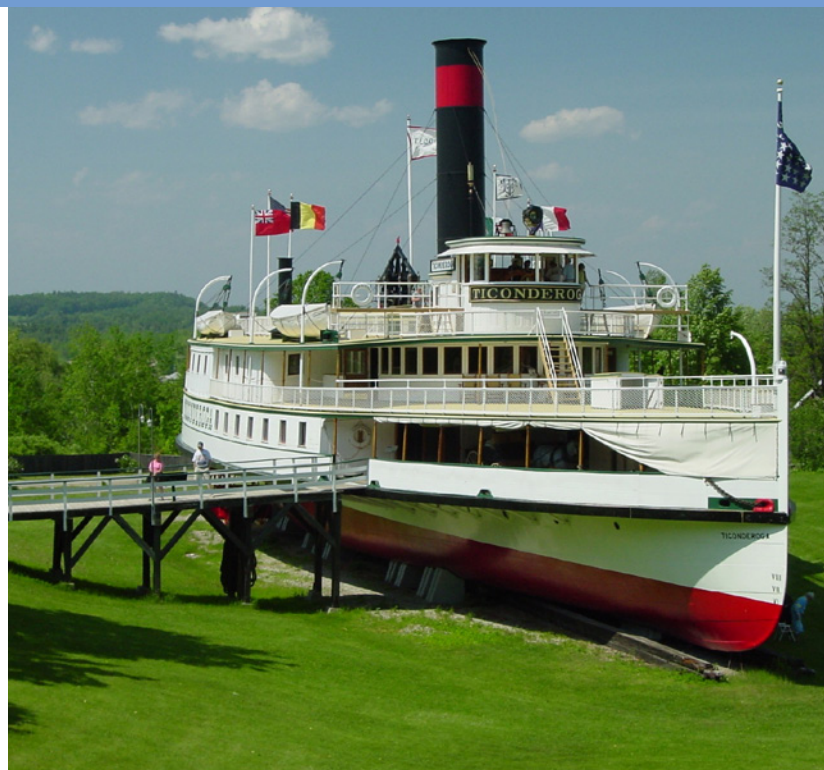
The Ticonderoga at Shelburne Museum, Shelburne/Andre Jenny

Motorists and bicyclists share scenic roads. Use caution on narrow, winding or unpaved roadway. Follow traffic laws and ride safely. Bicycles are vehicles by law and have the right to use public roads. You are responsible for operating your bicycle under all conditions.