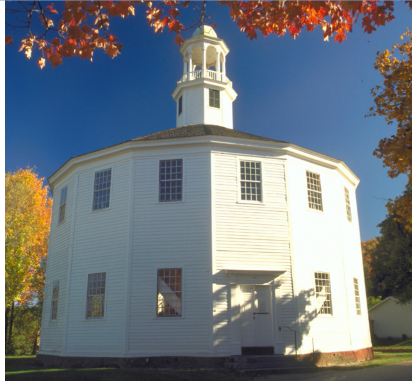
Old Round Church, Richmond/Andre Jenny

Motorists and bicyclists share scenic roads. Use caution on narrow, winding or unpaved roadway. Follow traffic laws and ride safely. Bicycles are vehicles by law and have the right to use public roads. You are responsible for operating your bicycle under all conditions.