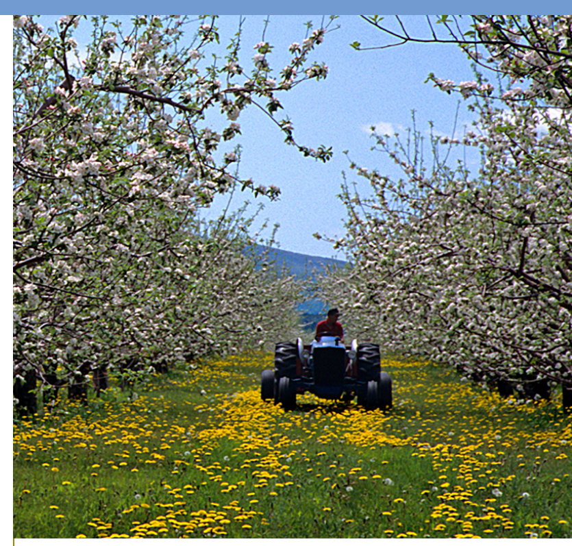
Apple blossoms in Peru

Motorists and bicyclists share scenic roads. Use caution on narrow, winding or unpaved roadway. Follow traffic laws and ride safely. Bicycles are vehicles by law and have the right to use public roads. You are responsible for operating your bicycle under all conditions.