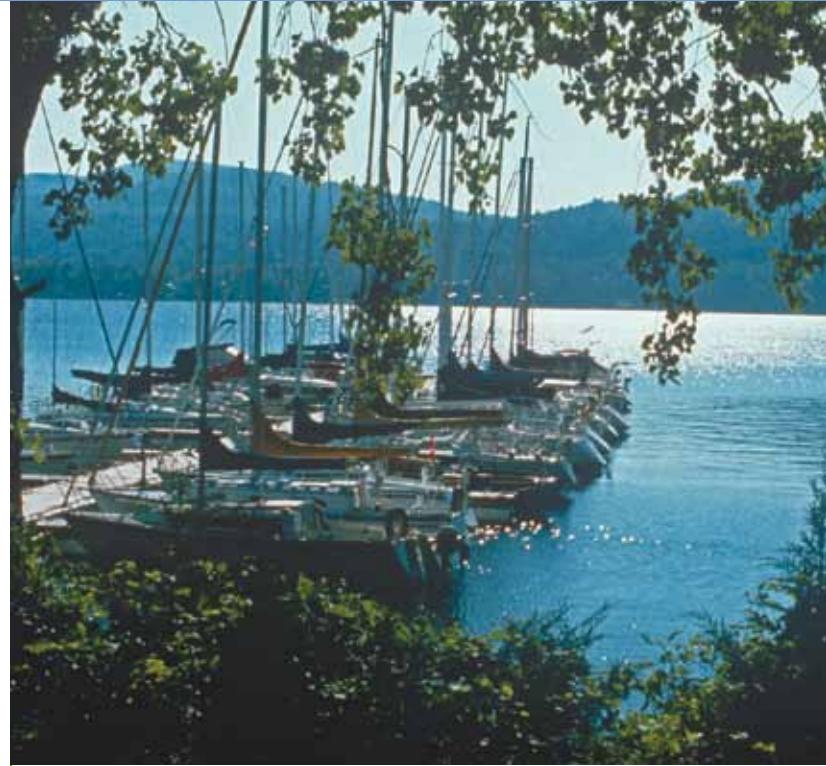
Sailboats in marina on Lake Champlain

Motorists and bicyclists share scenic roads. Use caution on narrow, winding or unpaved roadway. Follow traffic laws and ride safely. Bicycles are vehicles by law and have the right to use public roads. You are responsible for operating your bicycle under all conditions.