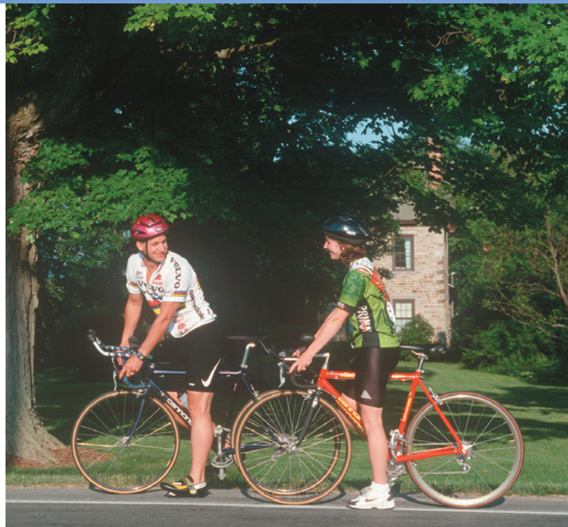
Biking in historical Clinton County

Motorists and bicyclists share scenic roads. Use caution on narrow, winding or unpaved roadway. Follow traffic laws and ride safely. Bicycles are vehicles by law and have the right to use public roads. You are responsible for operating your bicycle under all conditions.