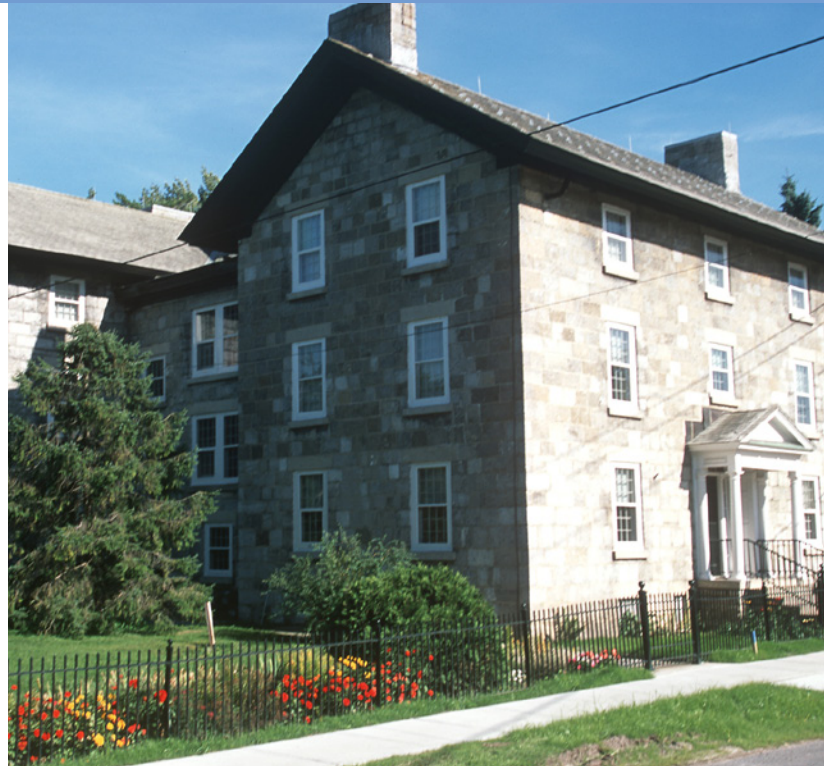
Alice T. Miner Museum, Chazy

Motorists and bicyclists share scenic roads. Use caution on narrow, winding or unpaved roadway. Follow traffic laws and ride safely. Bicycles are vehicles by law and have the right to use public roads. You are responsible for operating your bicycle under all conditions.