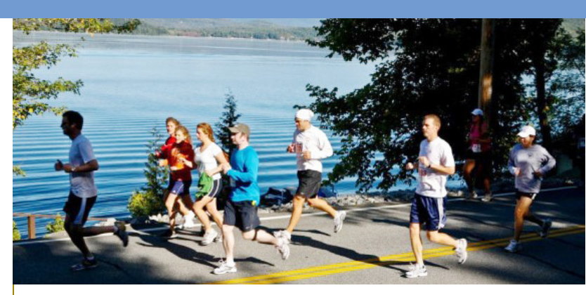
Adirondack Marathon Trail

Motorists and bicyclists share scenic roads. Use caution on narrow, winding or unpaved roadway. Follow traffic laws and ride safely. Bicycles are vehicles by law and have the right to use public roads. You are responsible for operating your bicycle under all conditions.