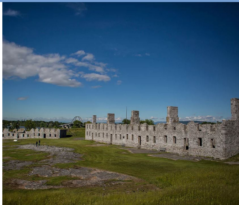
Crown Point State Historic Site

Motorists and bicyclists share scenic roads. Use caution on narrow, winding or unpaved roadway. Follow traffic laws and ride safely. Bicycles are vehicles by law and have the right to use public roads. You are responsible for operating your bicycle under all conditions.