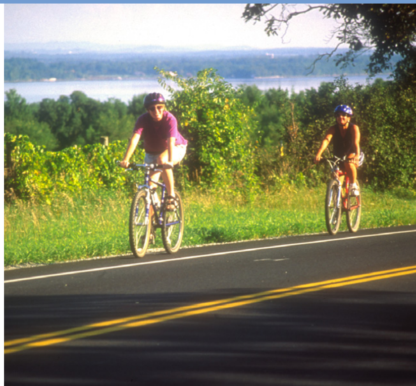
Cyclists touring the Champlain Bikeway

Motorists and bicyclists share scenic roads. Use caution on narrow, winding or unpaved roadway. Follow traffic laws and ride safely. Bicycles are vehicles by law and have the right to use public roads. You are responsible for operating your bicycle under all conditions.