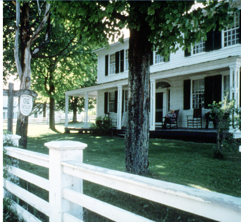
Penfield Museum, Ironville

Motorists and bicyclists share scenic roads. Use caution on narrow, winding or unpaved roadway. Follow traffic laws and ride safely. Bicycles are vehicles by law and have the right to use public roads. You are responsible for operating your bicycle under all conditions.