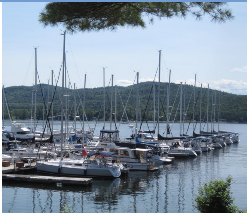
ROOST-Lake Champlain Region

Motorists and bicyclists share scenic roads. Use caution on narrow, winding or unpaved roadway. Follow traffic laws and ride safely. Bicycles are vehicles by law and have the right to use public roads. You are responsible for operating your bicycle under all conditions.