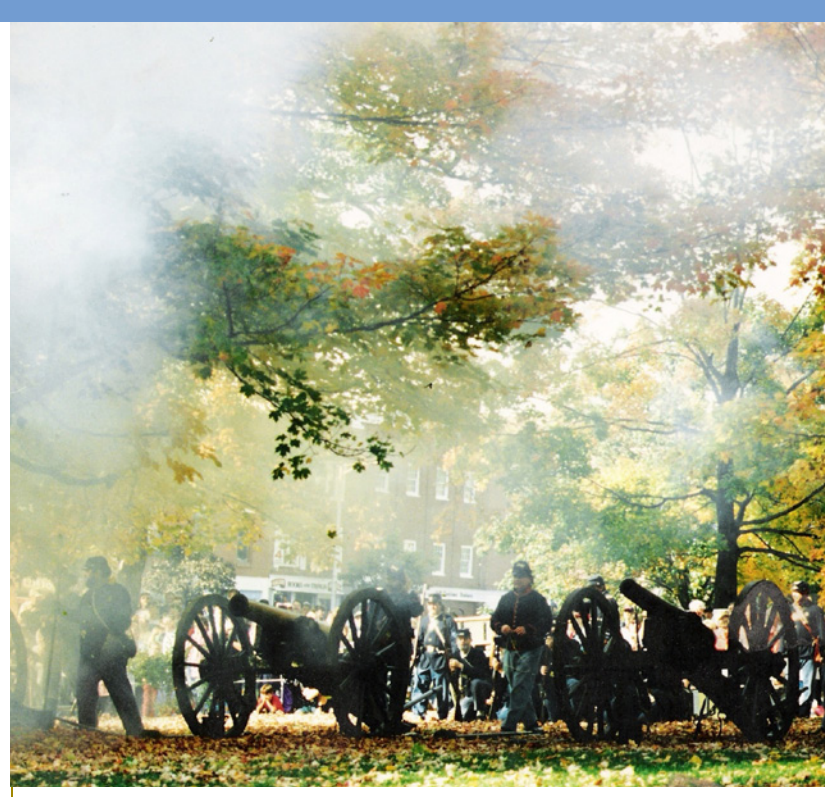
Civil War Reenactment/Karen Bresnahan, St. Albans for the Future

Motorists and bicyclists share scenic roads. Use caution on narrow, winding or unpaved roadway. Follow traffic laws and ride safely. Bicycles are vehicles by law and have the right to use public roads. You are responsible for operating your bicycle under all conditions.