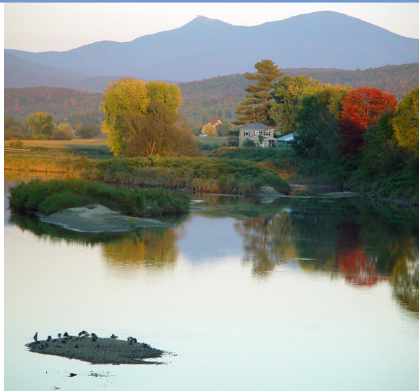
Jay Peak in Air and Water/Ann Hull & Northwest Vermont Rail Trail Council

Motorists and bicyclists share scenic roads. Use caution on narrow, winding or unpaved roadway. Follow traffic laws and ride safely. Bicycles are vehicles by law and have the right to use public roads. You are responsible for operating your bicycle under all conditions.