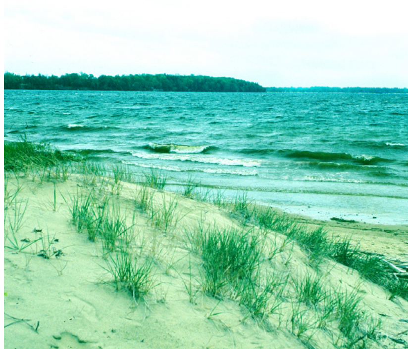
Alburgh Dunes State Park/VT Department of Forests, Parks and Recreation

Motorists and bicyclists share scenic roads. Use caution on narrow, winding or unpaved roadway. Follow traffic laws and ride safely. Bicycles are vehicles by law and have the right to use public roads. You are responsible for operating your bicycle under all conditions.