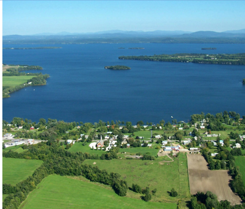
Aerial of Keeler Bay/Shirley Chevalier

Motorists and bicyclists share scenic roads. Use caution on narrow, winding or unpaved roadway. Follow traffic laws and ride safely. Bicycles are vehicles by law and have the right to use public roads. You are responsible for operating your bicycle under all conditions.