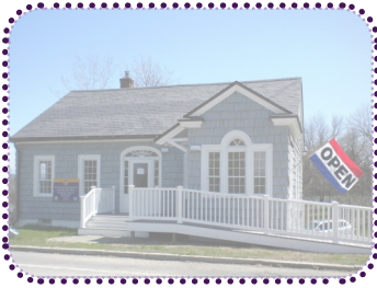
Lake Champlain Visitors Center