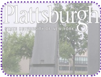
Plattsburgh State Art Museum