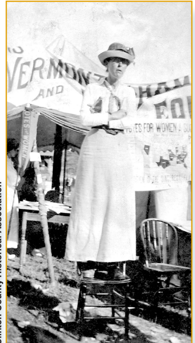
Vermont Historical Society