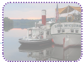
Lake Champlain Maritime Museum