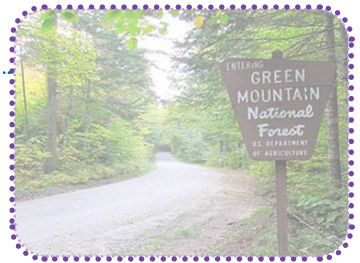
Green Mountain National Forest