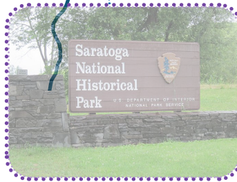
Saratoga National Historical Park