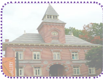
Lake George Historical Association & Museum