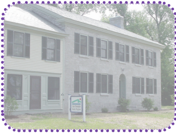
Gordon Center House