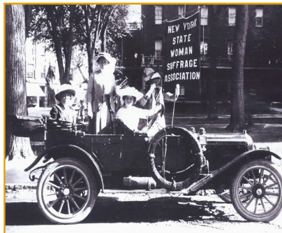
Clinton County Historical Association

In celebration of the Centennial of Women's Suffrage Movement, the CVNHP produced this commemorative Stamp Cancellation Passport for 11 locations throughout the national heritage area. These sites represent the arts, outdoor recreation, land conservation, military history, commerce, natural history, wildlife conservation, and many other aspects of the CVNHP. So, get your passport stamped for exploration, inspiration and adventure!