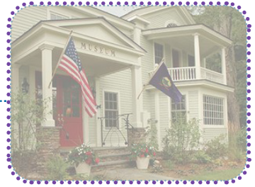
American Museum of Fly Fishing