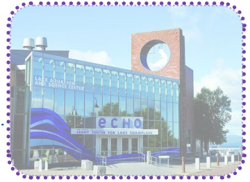
ECHO, Leahy Center for Lake Champlain