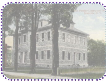
Pember Museum of Natural History