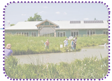
Missisquoi National Wildlife Refuge